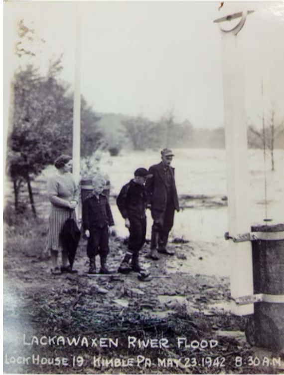
Blast from the Past 1942 Flood See Page 9