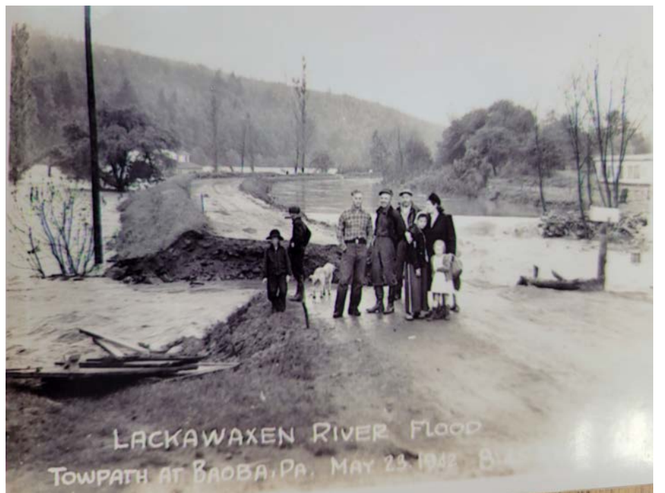
LACKAWAXEN RIVER FLOOD TOWPATH AT BAIBA PA. MAY 23, 1942 8:30 AM