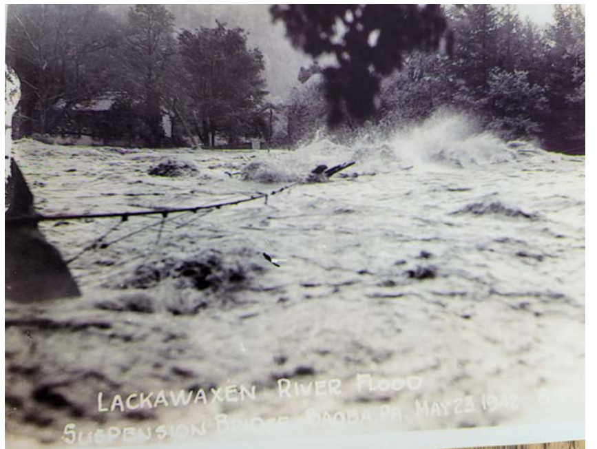
LACKAWAXEN RIVER FLOOD SUSPENSION BRIDGE BAIBA PA. MAY 23, 1942