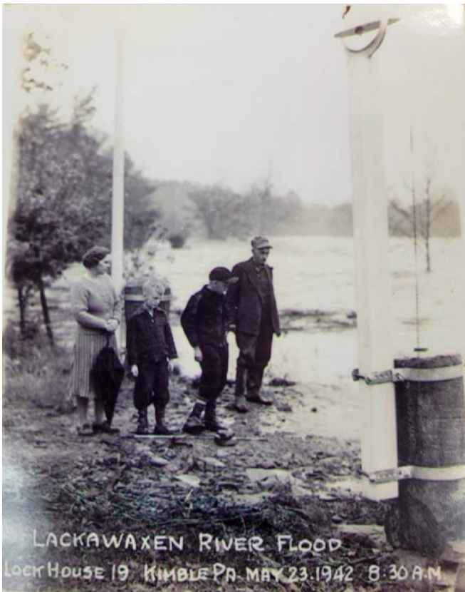
LACKAWAXEN RIVER FLOOD Lock House 19 KIMBLE PA. MAY 23, 1942 8:30 AM