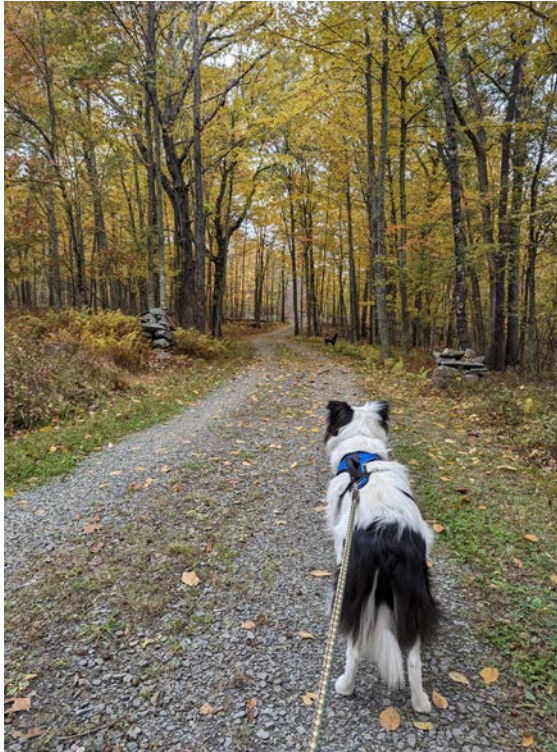
Get to Know Your Parks Veterans & Sunrise Parks! See Page 6