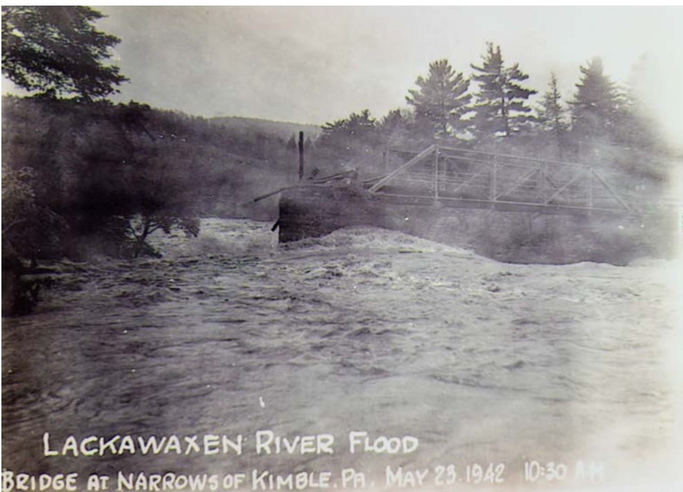
LACKAWAXEN RIVER FLOOD BRIDGE AT NARROWS OF KIMBLE PA. MAY 23, 1942 10:30 AM